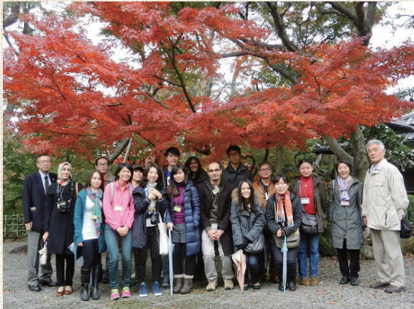
This is a picture that I took with MIFA (Meguro International Friendship Association) members when I went to Shibuya last autumn.

Japanese government entitle us to write a confidential documents to civil polity instead of applicant.